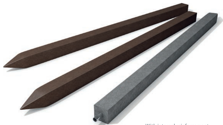
..... With internal reinforcement (Sectional view)