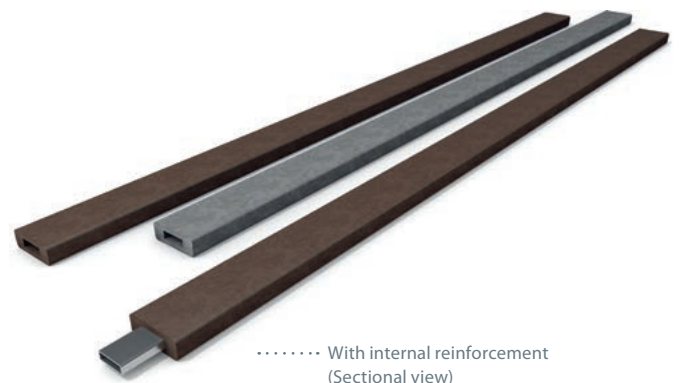
..... With internal reinforcement (Sectional view)

Temperature-dependent length fluctuation (up to +/- 1.5 %) can appear, please inquire about the maximum span.